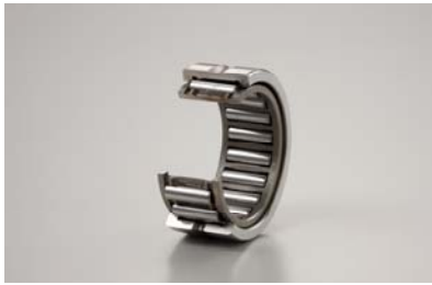
RNA..49M, NK..M TYPE